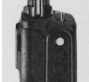
Programmable buttons and switches